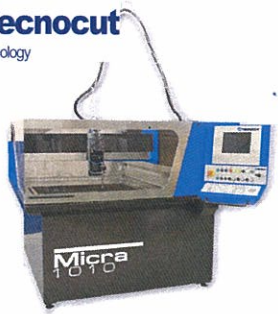
CNC 3 axis waterjet cutting